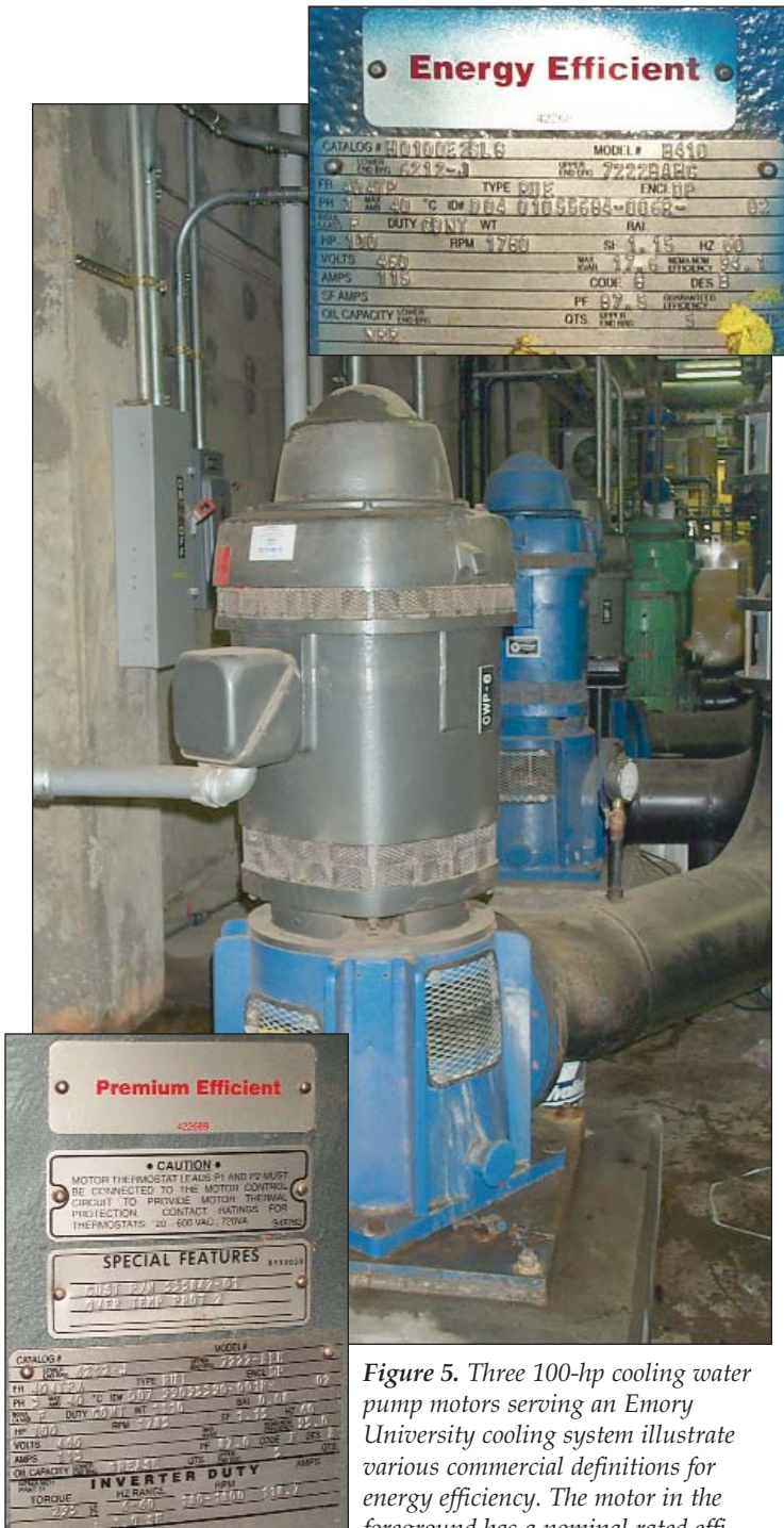
Figure 5. Three 100-hp cooling water pump motors serving an Emory University cooling system illustrate various commercial definitions for energy efficiency. The motor in the foreground has a nominal rated efficiency of 95.0% and carries a "Premium Efficient" label. 100-hp motors that qualify for the NEMA Premium rating have a nominal energy efficiency rating of 95.4%. Neither EAct nor NEMA Premium requirements apply to vertical, inverter-duty motors such as the one pictured here. The blue motor (center) carries an "Energy Efficient" label and is rated at 94.1%. The average efficiency of older, standard-efficiency motors such as the green unit shown at the rear of the photo is 92.3%. To ensure a true "premium efficiency" motor, look for a NEMA Premium label, or compare the nameplate efficiency data to the NEMA Premium requirements.

Sam McCullough is the service center's owner and chief technical specialist. McCullough has seen motor replacement