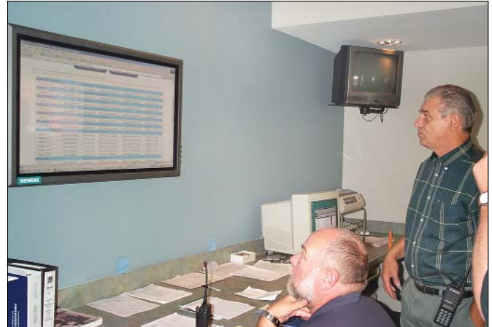
Figure 2. The operations center at Emory's Facility Management Division receives real-time performance data from ChillerCheck software, which collects data from sensors in Emory's 41 chillers. The software calculates operating efficiency for each chiller, compares results with nameplate efficiency and flags potential trouble spots on a display screen (photo) when efficiency drops by more than 5%. Operators can optimize a chiller selection based on this information and can schedule maintenance and repair when needed. The software also monitors the power drawn by HVAC system motors, alerting operators to potential electrical problems.

and outlet temperatures and flow rates, refrigerant temperature and pressure, bearing performance and other factors, along with power consumption (volts and amperes for each phase on drive motors). The software calculates real-time efficiency for each chiller and compares it with guaranteed nameplate values. It then reports each unit's efficiency loss, if any, to the system operator at a central control station and to Kicak's office PC as well as his PDA ( Figure 2 ).