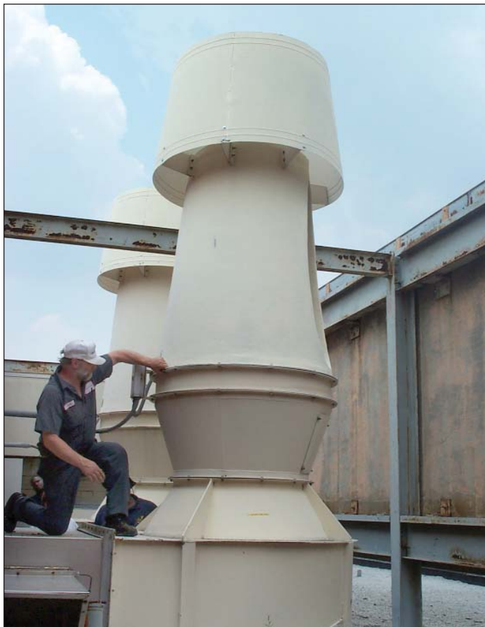
Figure 1. Two large exhaust fans on one of Emory University's research buildings. Emory design guidelines call for high-efficiency motors for its many chillers, air handlers, pumps and related equipment, which together account for more than 25% of the university's energy bill.

On the cover: Emory University, located in Atlanta, is a recognized center for biomedical research and home to some 11,000 students. Keeping its students and laboratories cool requires more than 25,000 tons of air conditioning with an energy bill of $2.5 million per year. Use of premium-efficiency motors in HVAC equipment helps keep energy costs down.